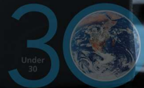
Judith Gillespie CBE Pioneer for Change