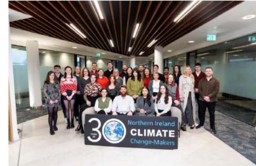
2025 30 Under 30 Climate Change Makers cohort

This programme aims to keep Northern Ireland Beautiful