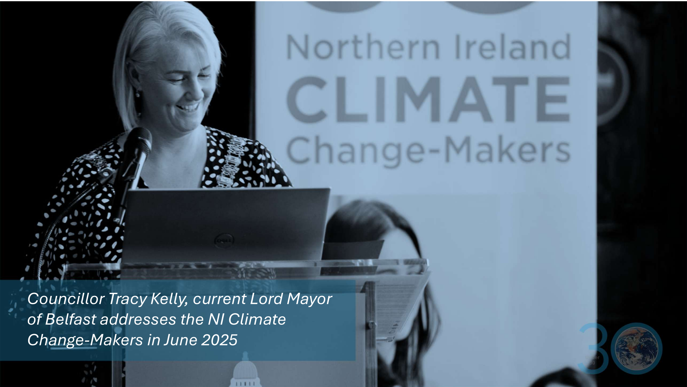
Councillor Tracy Kelly, current Lord Mayor of Belfast addresses the NI Climate Change-Makers in June 2025